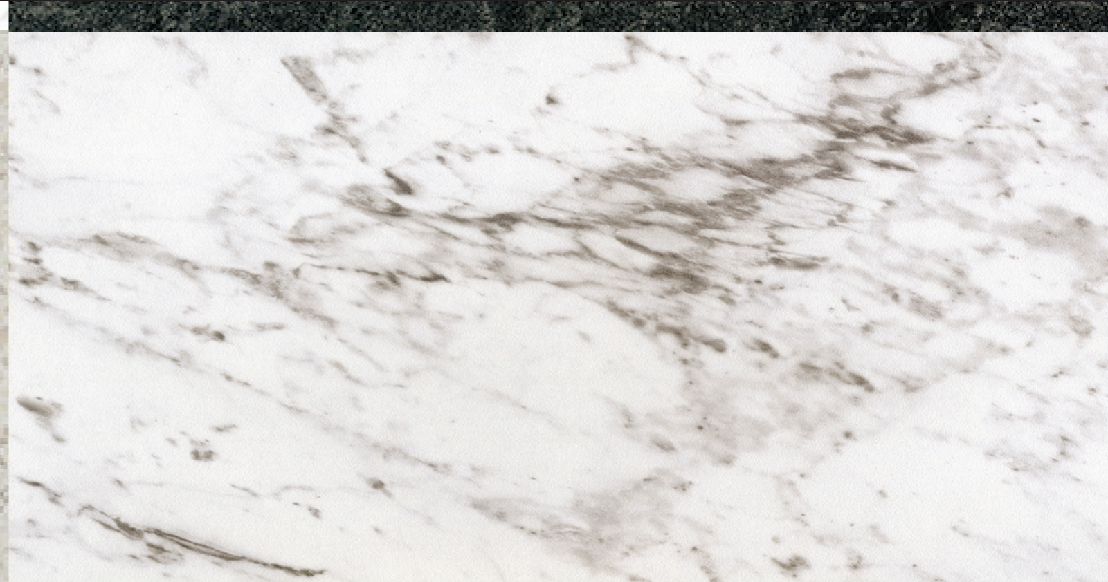
MOTIVI | 5055 HG MAR | Arabescato