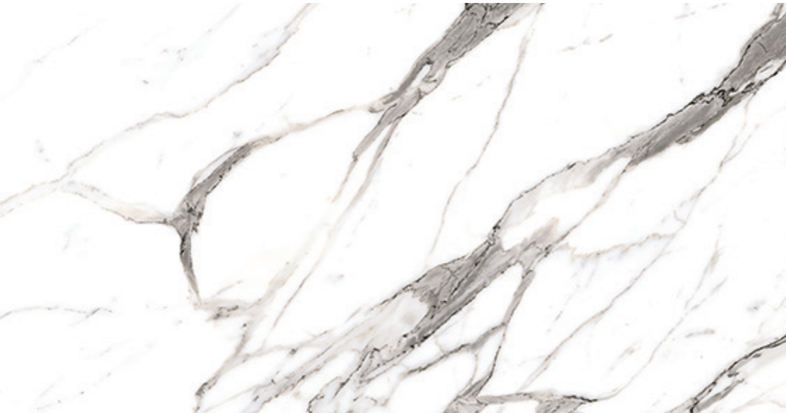
MOTIVI | 5145 HG MAR | Calcutta